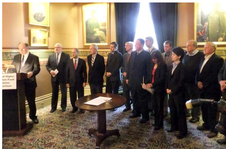
Members of the Higher Education Food Systems Consortium

Today, members of the VHEFSC are designing new ways to collaborate, share students and resources and expand elective opportunities for place-based food systems education where “Vermont is our classroom.” We are advancing an ambitious action plan to make Vermont the epicenter of the food systems movement in higher education in this country. Members will work together to attract students and future working lands entrepreneurs to Vermont. Find out more at http://vtrural.org/programs/facilitation/food-systems .