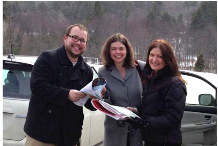
VCRD's Vermont Digital Economy Project staff

Expanding the use of online resources has benefits far beyond emergency management. Downtown businesses, service providers, farmers, and the tourism industry are all finding opportunities to reach new audiences and markets. At the same time, the social fabric of our communities is getting stronger as a result, as neighbors share local online conversations. Through this project businesses are improving their bottom line, while government and nonprofit organizations are developing ways to deliver services more effectively. Find out more at vtdigitaleconomy.org .