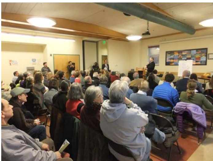
Community Meeting Day in Manchester

Visit vtrural.org/program/community-visits to read community visit reports and find out more about the Community Visit program.