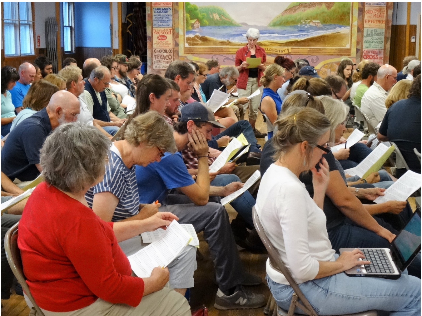
Burke community members read the opportunities list together on Community Meeting Day.

Some residents believe that the task of promoting additional infrastructure in the village, managing traffic, and developing local access need more staffing support at the Town level. A Burke Community and Economic Development staff position could provide additional leadership for town communication, infrastructure development, grant writing, and business support to help the community as a whole move forward.