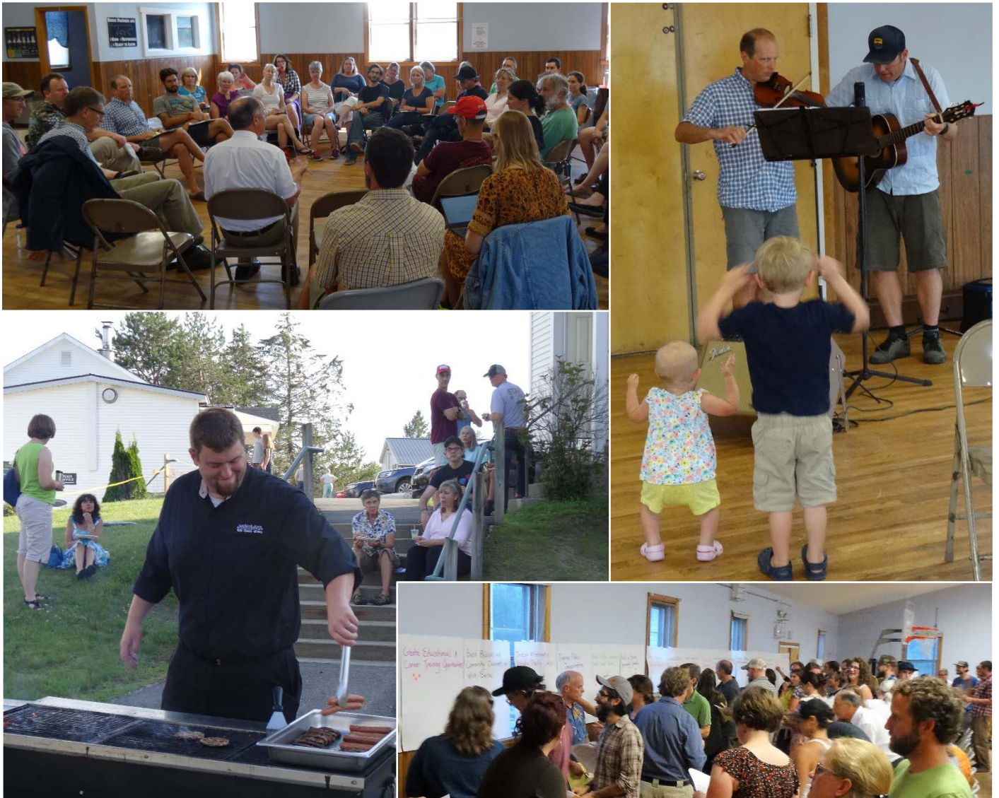
From top: One of 6 Community Visit Day forums where residents shared ideas for the future; Dancing to the Bald Mountain Boys at the Community Visit Day Dinner; Free barbeque dinner provided by the Burke Town School on Community Visit Day; Community members took part in a dot-voting exercise on Community Meeting Day to select priorities for action.

At VCRD, we are so proud each day that we work in a place where community is real and strong, and where local residents work together to get things done to make their communities the best they can possibly be. It was a great pleasure to work with the residents of Burke who stand up for the town and who are lined up for the common good and best future for this wonderful community. We are eager to continue following and supporting your success!