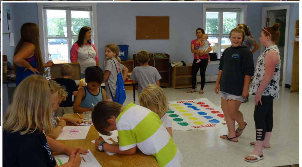
Scenes from Community Visit Day.